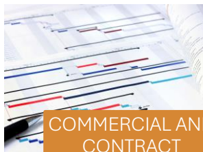
COMMERCIAL AND CONTRACT TRAINING