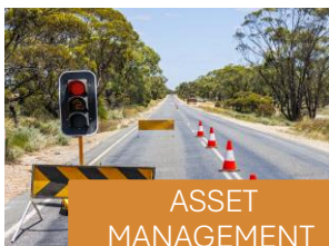
ASSET MANAGEMENT TRAINING